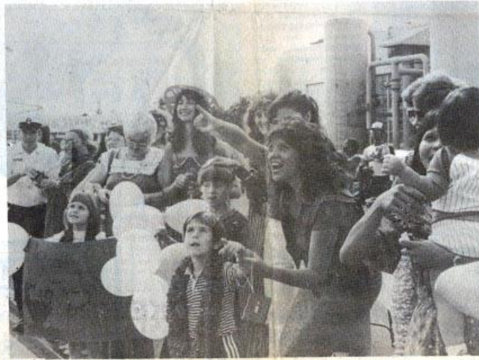
THERE HE IS — An excited wife sees her husband and helps their son find him while the USS Davidson returns from a six-month deployment.