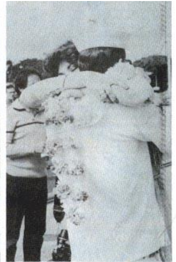
HOME! — Sometimes words aren't enough. A hug says so much to a homecoming sailor.