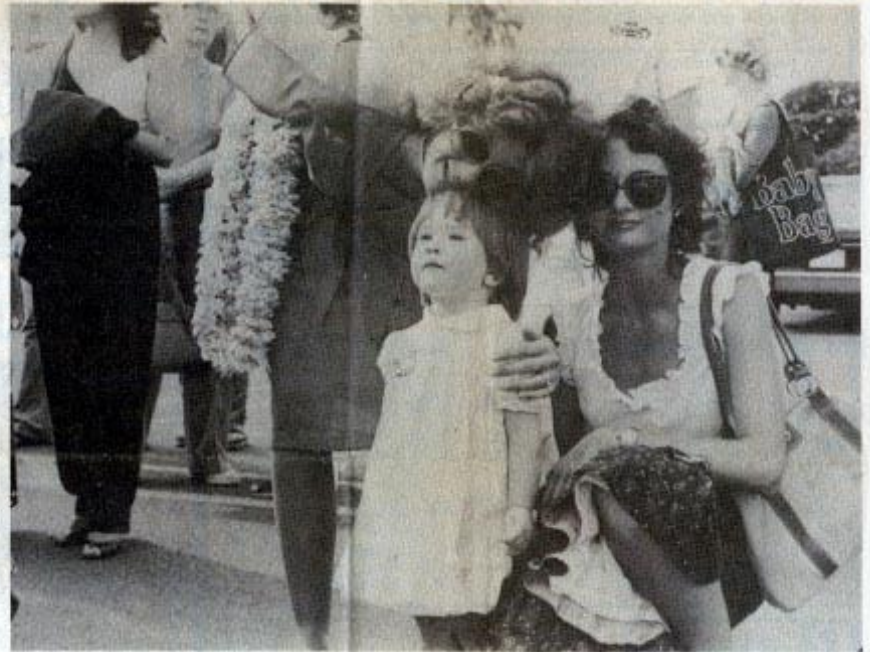
WHERE'S HE AT? — Frequently heard on the pier was, "Where's my daddy?" This young lady, with help from her mother and a family friend, looks for her father.