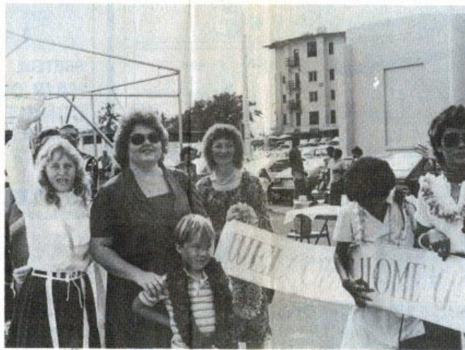
WELCOME HOME — A daughter waves to her father while her mother and other family members of USS Davidson crewmembers hold a special sign.